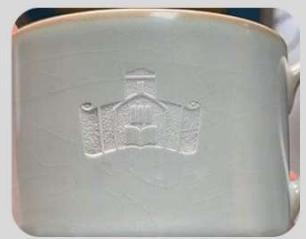
Laser Engraving Ceramic Effect