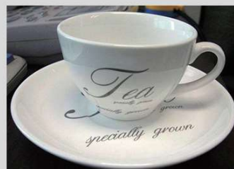
Blue Light Engraving Ceramic Effect

455 Blue Light is suitable for bamboo, leather, colored glass, ceramics and other laser engraving effect is not obvious materials